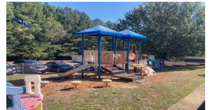
Finished installation at St. Luke's.