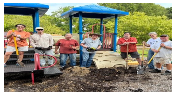
New Creation removing the equipment.